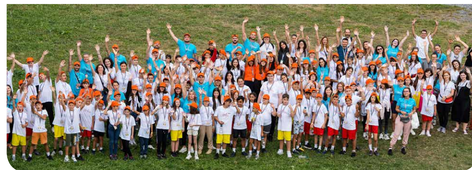
Activities during the U&I Summer Camp within the Future Acceleration Program, photo Cătălin Georgescu.