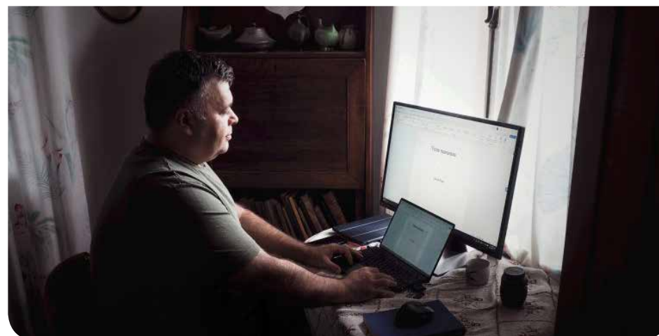
Page 41. 1, 2, 3. Residences at Golescu Villa, 3 rd edition, May-June 2023.