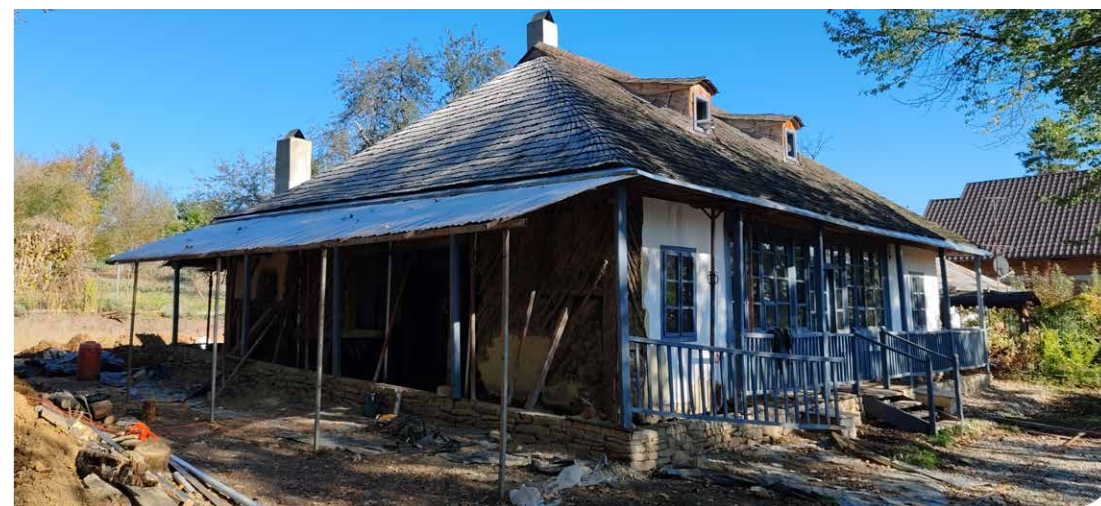
1. George Enescu House in Mihăileni