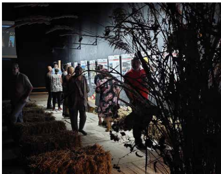
1, 2, 3. Concerts on the Siret River 2023, Călinești, photo Raluca Știrbăț.