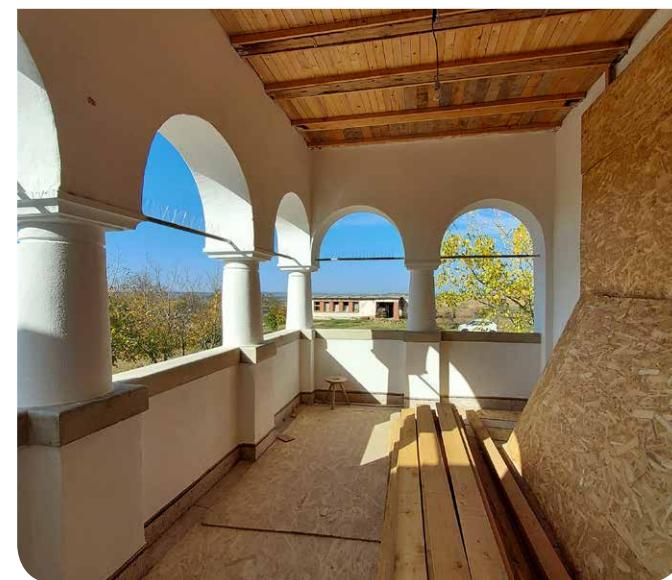
1. Neamtu Manor garden. 2. Neamtu manor loggia.

The mansion is a landmark in the cultural landscape of the village and the area.