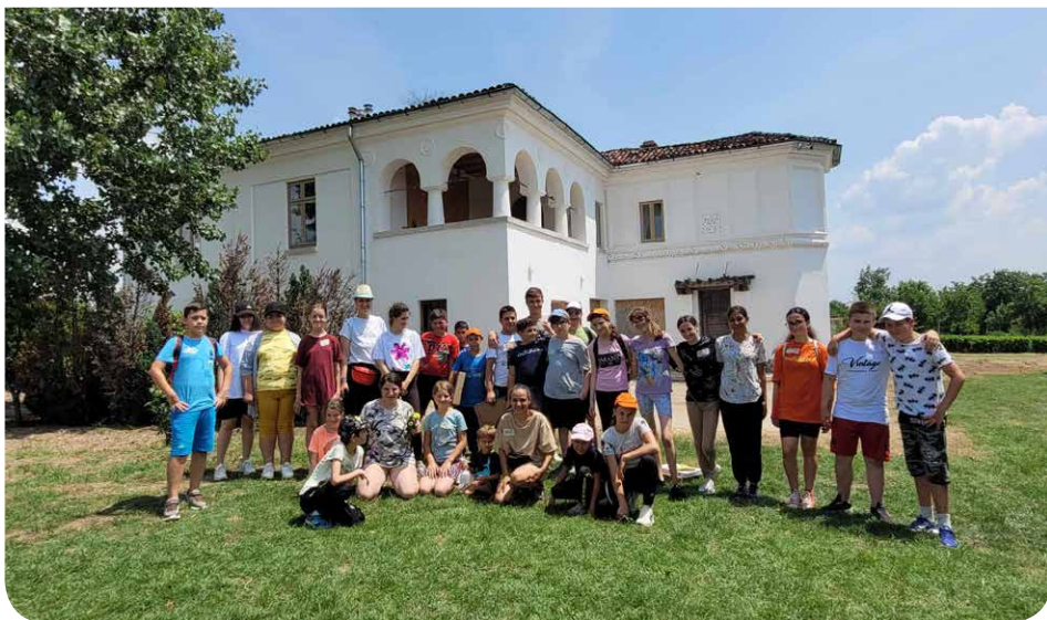
Page 18. 1, 2. Moments during heritage education workshops, Conacul Neamtu in Olari, photo Pro Patrimonio archive.