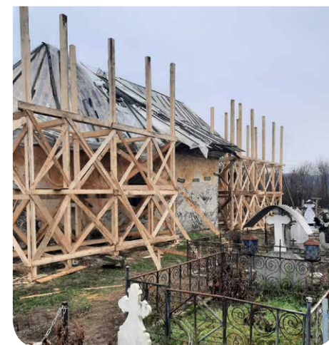
Pag. 14. Șirineasa Church, S-W side, summer 2012, photo Pro Patrimonio archive.