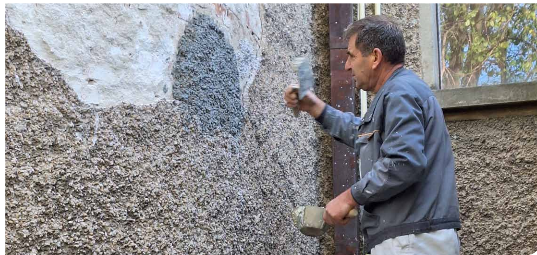
1, 2. Facade cleaning during the Historical Plasterwork research project, photo Pro Patrimonio archive.

This research project aims to study methods of repairing deterioration by collecting and carrying out more extensive samples, material analysis, access to restoration sites for study and testing, collaboration with public institutions, material suppliers and contractors.