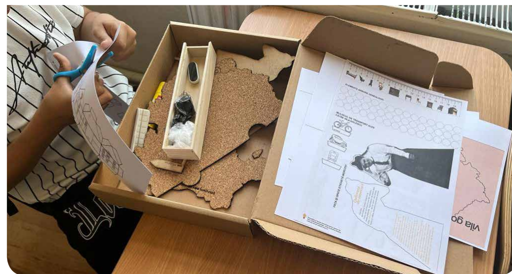
1, 2. "Heritage in Package" kits, details, photo Pro Património archive.

A large part of the workshops initiated by Pro Património are addressed especially to children and young people in areas, sometimes poor and destructured, where we carry out projects to save, preserve and rehabilitate the architectural heritage (Golescu Villa in Câmpulung, Neamțu Manor in Olari, Enescu House in Mihăileni, etc.).