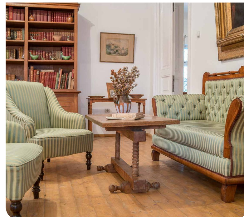
1, 2. The Golescu Villa in Câmpulung Muscel, photo Cristian Radu.

Vasile Golescu (1875-1920), the father of the Golescu twin sisters, built the villa with ground floor and first floor in 1909, as a holiday home on the western hill, overlooking the town of Câmpulung Muscel, and named it the Ștefan Villa, in memory of his son who died during the war of 1914. As a forest engineer who graduated in 1897 from the École des Eaux et Forêts de Nancy, Vasile Golescu designed the terraced park around the house (a garden park), adapting exotic and rare species, brought at the beginning of the last century from abroad, starting from the local natural forest.