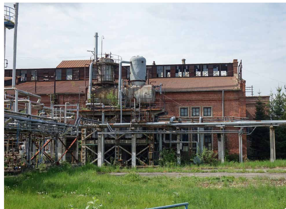
Page 38. 1. Former Textile Enterprise Lugoj, photo Facebook page Lugoj - lost identity . 2. "Gheorghe Coman" memorial house, Slănic Prahova, photo Pro Patrimonio archive.