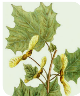
Plane Platanus × hispanica Mill. ex Münchh.

A species native to North America, introduced to Europe as a decorative shrub. It is also called "Carolina Allspice" because of its aromatic bark (similar to cinnamon), used as a condiment by Native American populations.