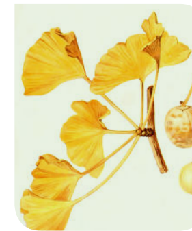
Ginkgo Ginkgo biloba L.