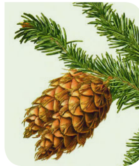
Douglas Fir Pseudotsuga menziesii (Mirb.) Franco

Species of Chinese origin, despite the name. It is also called the pagoda tree, because its very resistant wood has been used historically in the construction of Japanese pagodas. It was introduced to Europe only in the second half of the 18 th .