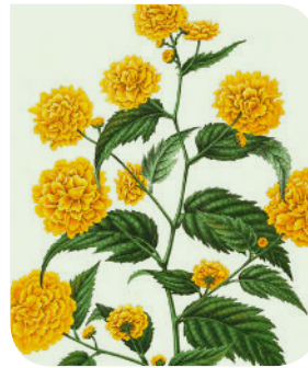
Japanese Marigold Bush Kerria japonica L.

Species of North American origin. The Catalpa tree from Golescu Park is special because it was naturally grafted with a specimen of Acer , which grows inside it from a seed that got there by chance.