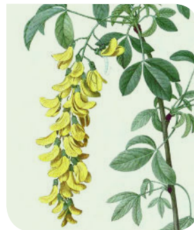
Golden Chain Laburnum anagyroides Medik.

Originally from North America; introduced to Europe as a decorative tree. Its fruits, the size of some oranges, are not edible. Its extremely dense and elastic wood was preferred by the Native American tribes for making arches.