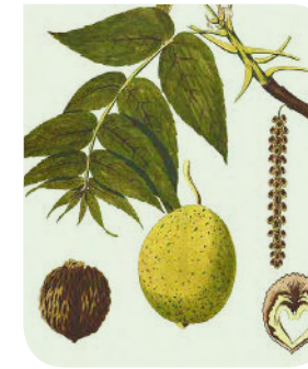
Eastern American Black Nut Juglans nigra L.

propatrimonio.org fb.com/FundatiaProPatrimoniO