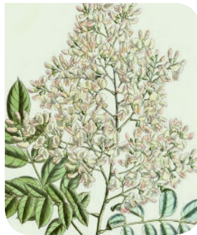
Japanese Pagoda Tree Styphnolobium japonicum (L.) Schott

Decorative shrub native to East Asia, introduced in Europe in the 19 th century. Its botanical name was given in honor of William Kerr, a British botanist and naturalist who studied the flora of Asia, and who sent the first copies to the Kew Botanical Garden in the United Kingdom.