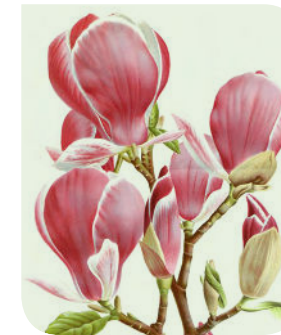
Magnolia Magnolia × soulangeana Soul.-Bod.

Originally from North America, this tree bears its name from its very dark wood and bark. The black walnut is famous how difficult it can be extracted from its shell. It was used as a medicinal plant by North-American tribes.