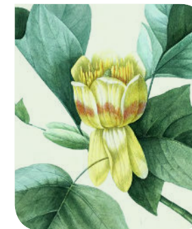
Tulip Tree Liriodendron tulipifera L.

Originally from Asia, this remarkable tree is called a "living fossil" because it is the only survivor of an ancient botanical group dating back to the time of the dinosaurs. It is a special decorative species due to its intense yellow, autumn-like foliage.