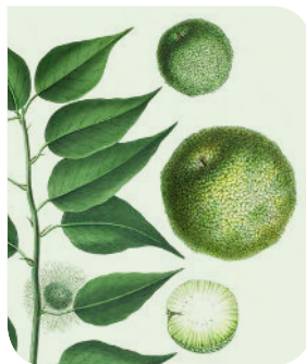
Osage Orange Maclura pomifera (Raf.) C.K.Schneid.

Hybrid species formed by the natural crossing between two species of plane tree, P. orientalis and P. occidentalis (American species), planted in proximity. It is often said that the place of origin of the first hybrid specimen would be Spain, sometime in the 17 th century.