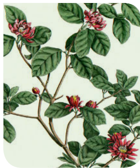
Eastern Sweetshrub Calycanthus floridus L.

A species of conifer native to North America; it became people's choice for their Christmas tree since the 1920s in the US, then in the rest of the world. Its popular name comes from David Douglas, a Scottish botanist who studied the flora of America and Europe at the turn of the 19 th century.