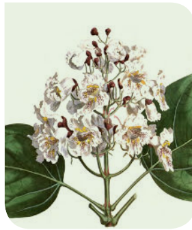
Catalpa Catalpa bignonioides Walter

Species of North American origin. The Catalpa tree from Golescu Park is special because it was naturally grafted with a specimen of Acer , which grows inside it from a seed that got there by chance.