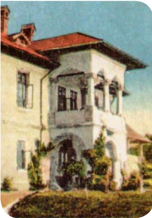
Golescu (Ștefan) Villa, period post card.

He is the supporter of measures for nature protection and forest management as well as of systematic initiatives of import and acclimatization of plants from North America, Asia, the Mediterranean basin, etc.