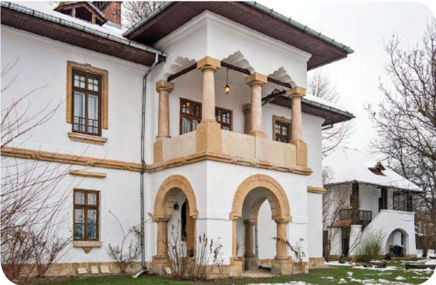
Golescu Villa and forest canton, photo from Pro Patrimonio archive.

The ensemble also includes a canton-annex, a typical model for the gardener's shelter, reminiscent of cule (fortified rural residences in the southern Carpathians), with the same expression in the national style.