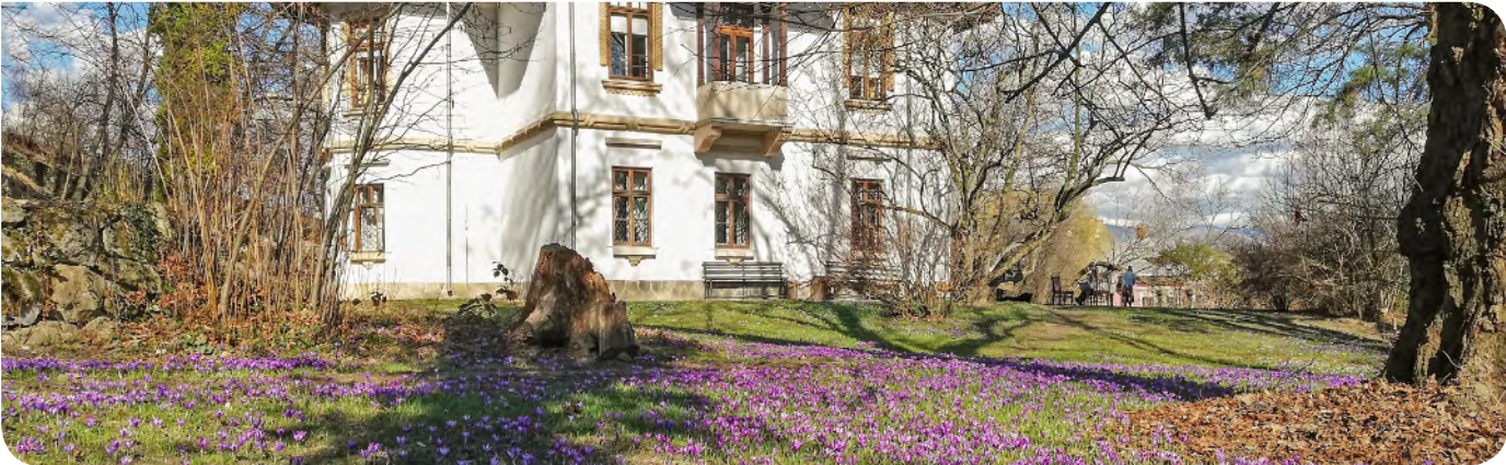
View of Villa Golescu from the park, photo Raluca Munteanu, 2020.

By creating the Golescu Ensemble in Câmpulung and through his contributions in the study of the forestry and the forestry fund, the establishment of modern forestry education (and, probably, the Forest Code from 1910), at the beginning of the past century Vasile Golescu left us as legacy a precious cultural landscape of public interest. His reason for protecting and conserving nature’s resources is equally relevant today for health, environment and forests protection and maintaining the ecological balance in the context of massive local deforestation and global climate change considered harmful and irreversible.