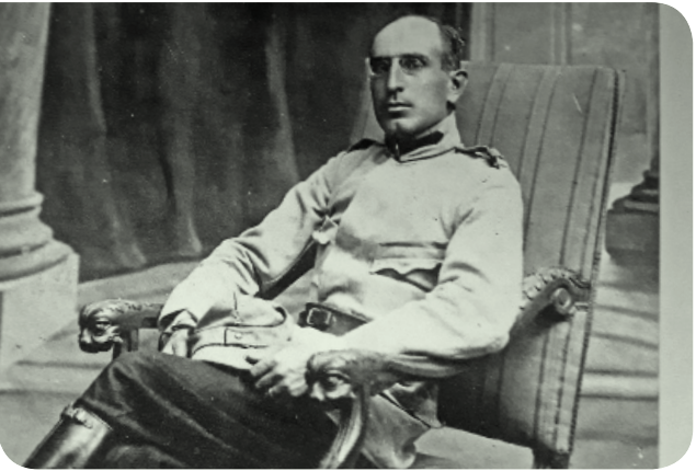
Vasile Golescu, 1913, Golești Museum collection in Ștefănești, Argeș county.

The villa and the Golescu Dendrological Park in Câmpulung Muscel, today owned by Pro Patrimonio Foundation, constitute a very valuable assembly of architecture and landscaping. The name Golescu belongs to one of the oldest families in the south of the Carpathians, who, through important scholars, politicians and intellectuals, contributed culturally, economically and politically to the modernization process of the Romanian people.