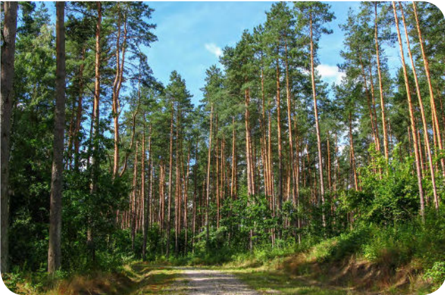
Pinus sylvestris forest, Wikimedia Commons photo.

Vasile Golescu contributes with important studies and researches, recognized even today, to the knowledge of the forest fund in the Muscel Mountains, the most relevant being the 1906 study on the spread and ecology of the pine ( Pinus sylvestris L.).