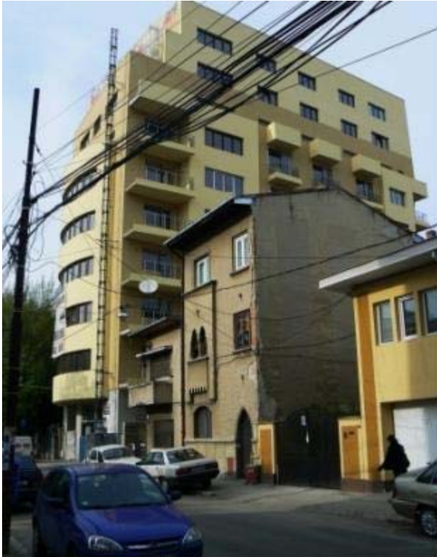
Aurel Vlaicu 120-12 sector 2